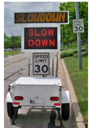
SMART 850 with variable message sign